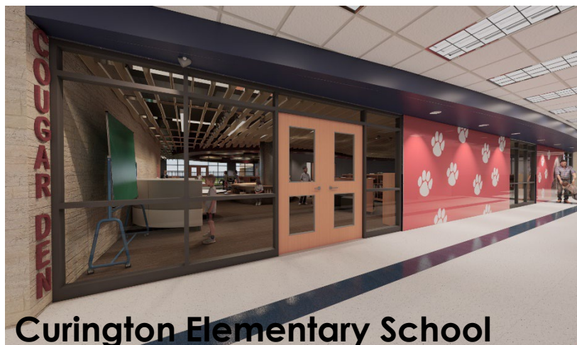
Curington Elementary School