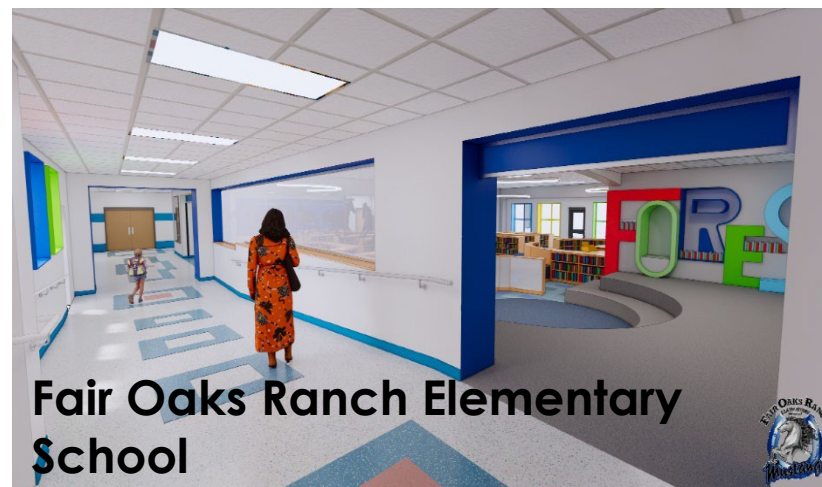
Fair Oaks Ranch Elementary School