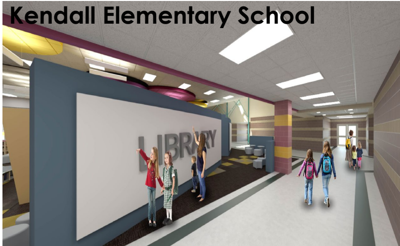
Kendall Elementary School